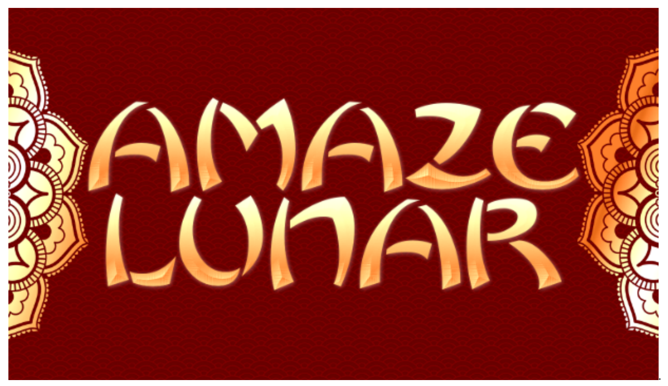
New casual puzzle game "Data mining 5" now available on Steam!:

Hello, dear Gamer! We have prepared for you new part our puzzle game, hope you like it! Thank you for your support us! Enjoy)